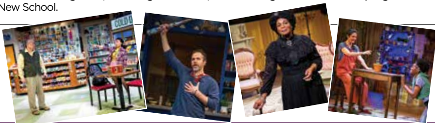
KIM'S CONVENIENCE • SUPPORT GROUP FOR MEN • THE HOUSE THAT WILL NOT STAND • ROOTED

Horizon annually offers a mainstage season of 5-7 contemporary plays for diverse Atlanta audiences and a Family Series for younger audiences. Horizon also develops new audiences and artists through our education and play development programs: the New South Play Festival, the New South Young Playwrights Contest and Festival, Black Women Speak (commissions of new works by Southern Black women playwrights), Horizon In-School Playwriting Workshops, the Horizon Apprentice Company (early career professionals), the Intern Program (for college students) and the high school theatre program at The New School.