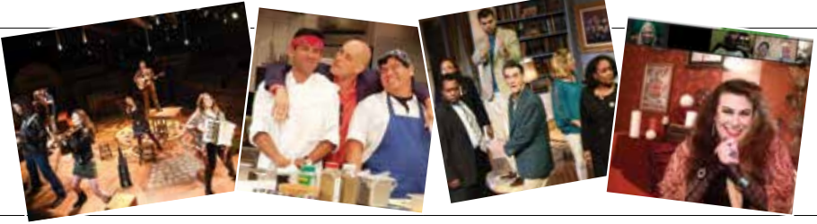
ONCE • HOW TO USE A KNIFE • SWEET WATER TASTE • GHOSTS OF LITTLE 5 POINTS

Horizon annually offers a mainstage season of 5-7 contemporary plays for diverse Atlanta audiences and a Family Series for younger audiences. Horizon also develops new audiences and artists through our education and play development programs: the New South Play Festival, the New South Young Playwrights Contest and Festival, Horizon In-School Playwriting Workshops, the Horizon Apprentice Company (early career professionals), the Intern Program (for college students) and the high school theatre program at The New School.