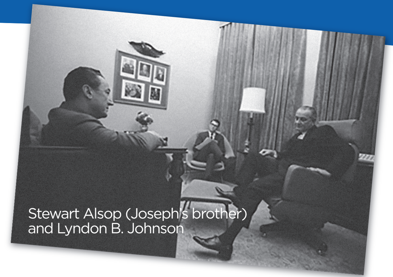
Stewart Alsop (Joseph’s brother) and Lyndon B. Johnson

along with rotating guests of political and journalist importance, are credited with not only influencing events such as the Cuban Missile Crisis, but also countless bills and legislature making it through Congress. No matter the issue at hand, all of the guests operated with the assumption that no matter what the perspective of a specific issue was, everyone was basically on the same side. There were battles, but not wars, and the expectation of civility prevailed.