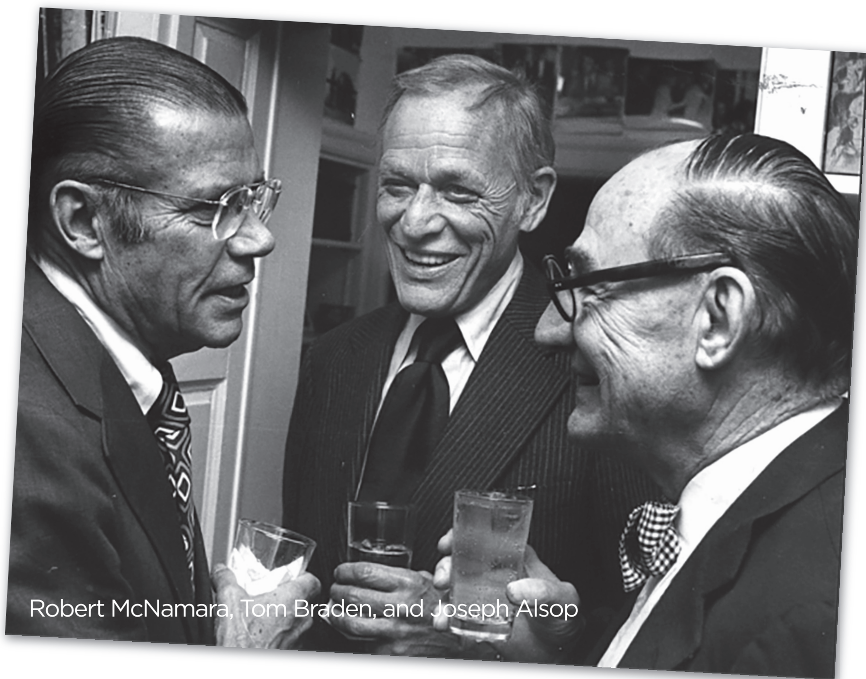
Robert McNamara, Tom Braden, and Joseph Alsop

discussing the critical issues of the day, prompted Henry James to call Washington DC the “city of conversation.”