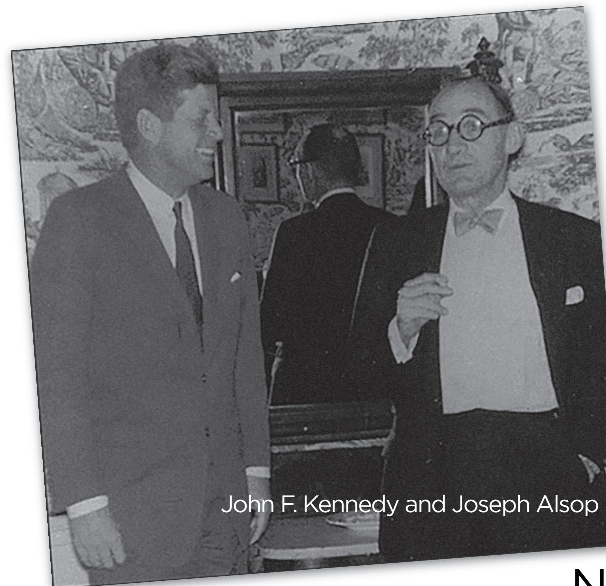
John F. Kennedy and Joseph Alsop

The Vietnam War was the beginning of the end, as the illusion of self-containment was lost, and the foreign policy establishment crumbled. After